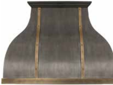
BRASS · PEWTER