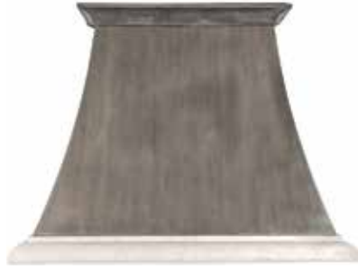
STONE · PEWTER