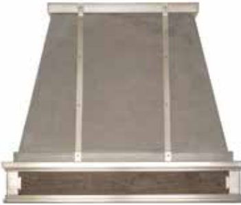
PEWTER · STONE · WOOD