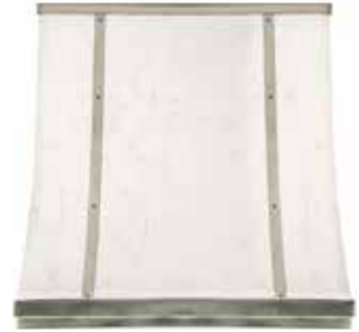
STONE · PEWTER