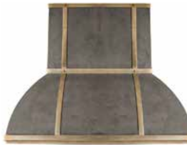
STONE · BRASS