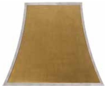
BRASS · PEWTER