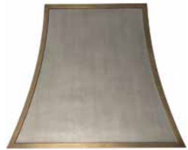
BRASS · PEWTER